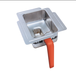
FUNNEL ASSY, SST-PP ORANGE HDL