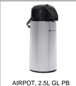
AIRPOT, 2.5L GL PB SINGLE PK