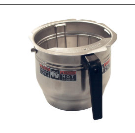
FUNNEL AY, W/DECAL GRT "C"7.12