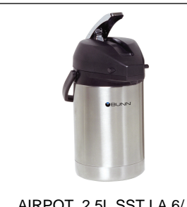
AIRPOT, 2.5L SST LA 6/ CASE