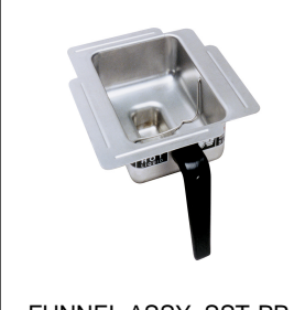
FUNNEL ASSY, SST-PP BLK HNDL